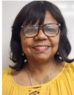
Pres. Gale Pinkston